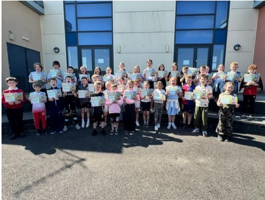
Here are the older pupils with 100% attendance